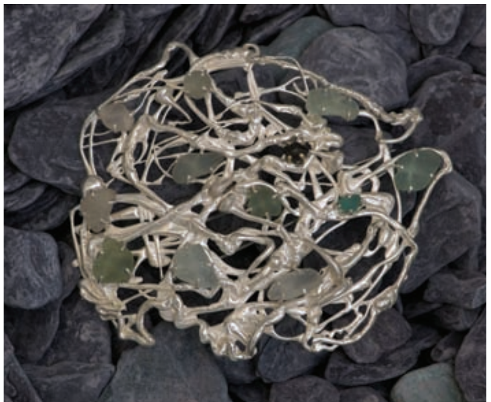
Vicky Forrester. Rock Pool Brooch. Cast in silver, with sea-glass. c.75 x 90mm.

Vicky Forrester has packed a great deal into a book which combines the best aspects of a jewellery magazine (lively layout and page-turning readability), recipe book (projects complete with materials and tools lists) and reference manual (technical instruction, tips and tricks of the trade). If your introduction to jewellery has been of a mostly practical nature then Elemental Jewellery will be an invaluable companion in supporting the development of your own unique creative voice.