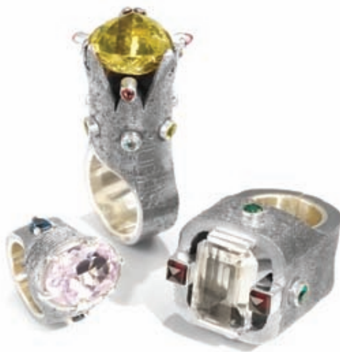
Dauvit Alexander. Three Post-Apocalyptic Cocktail Rings, 2009. Materials: Found corroded iron gas pipe and electrical circuit; silver; amethyst; pale citrine; lemon citrine; tourmaline; blue topaz; garnet; peridot; green quartz.

Crafthaus craft forum - http://www.crafthaus.ning.com/