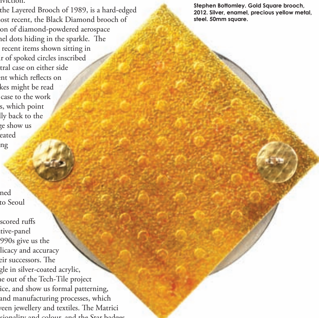
Stephen Bottomley. Gold Square brooch, 2012. Silver, enamel, precious yellow metal, steel. 50mm square.

simple and clear forms to foreground some subtle enamels on textured metal; the blue and white striped brooch is an eye-catcher, as is its friend with a square of lemon yellow on a gently undulating base. It is worth adding that many of these pieces have as interesting a back as a front: they may have colour variants, or a different surface, and a view from a different angle will give us something new. And that, too, is a likely projection for Stephen Bottomley's next 'Retrospective'.