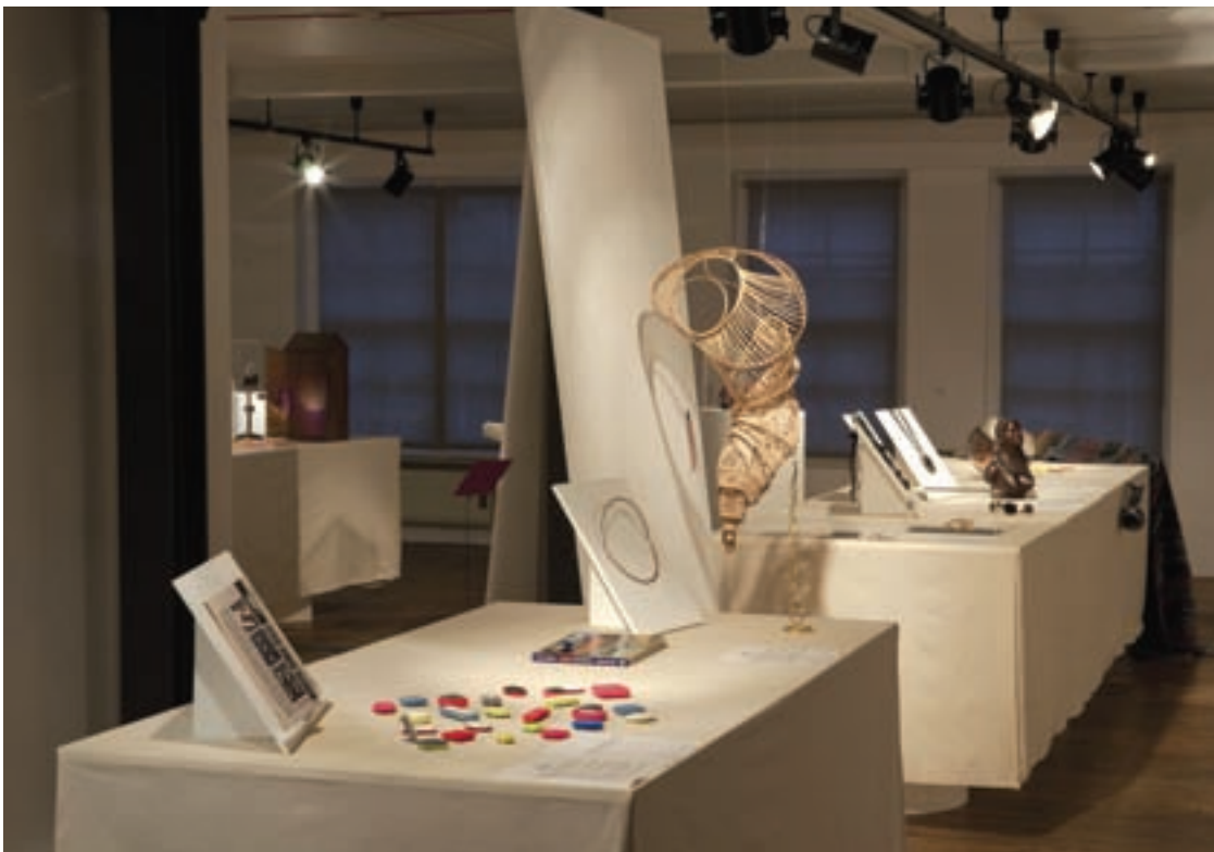
Installation view of the exhibition at Aram Gallery

It is to be hoped that the Aram Gallery will be encouraged by the positive reaction to this exhibition to feature contemporary jewellery on a regular basis.