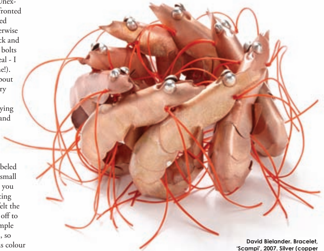
David Bielander. Bracelet, 'Scampi', 2007. Silver (copper anodised), elastics. 100mm diameter.

The range of contemporary designer-jewellery was excellent in an important exhibition that was the first of its kind at the Design Museum. As an introduction to artist-made jewellery it really tried